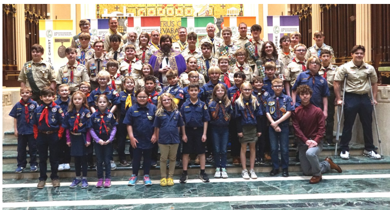
Cub Scouts, Scouts, and Scouters who received their religious emblems and adult awards at the Cathedral of Saint Peter in Chains in 2025.

Congratulations to all of this year's recipients!