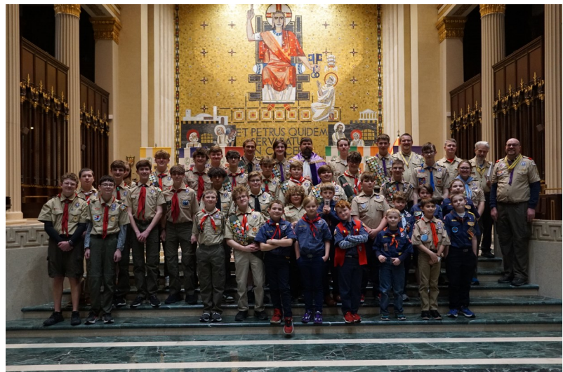
Cub Scouts, Scouts, and Scouters who received their religious emblems in at Cathedral of Saint Peter in Chains in 2024.